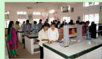
Soil Science & Agril. Chemistry Lab