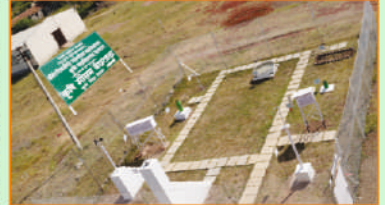
Agro - Meteorology Observatory

For Management Quota 24 Seats available. Registration on below web site www.coaphaltan.edu.in