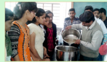
Post Harvest Tech. Lab