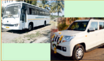
College Bus & Jeep