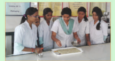
Animal Sci. & Dairy Science Lab