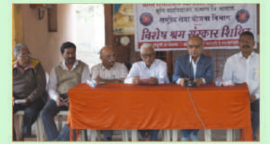
N. S. S.